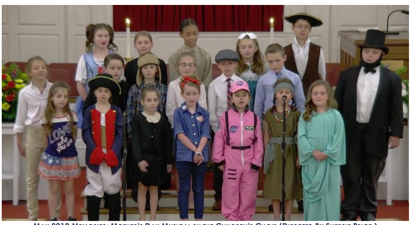
MAY 2019 MEMORIES: MOTHER'S DAY MUSICAL BY THE CHILDREN'S CHOIR (DIRECTED BY SHERRIE PRICE.)