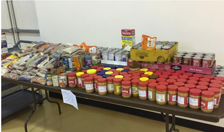
A PORTION OF THE FOOD COLLECTED FOR LOCAL FOOD BANKS DURING 30 FOR 70

On Friday April 26 th and Saturday April 27 th , 20 students and 16 adults participated