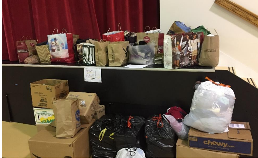
CLOTHING DONATIONS GATHERED DURING THE WEEKEND