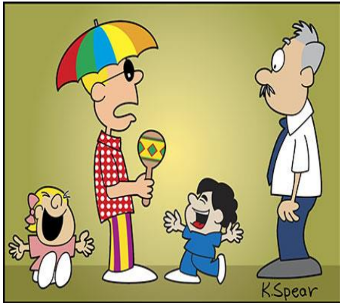
"Apparently, my spiritual gift is being silly with the toddlers."

July 22 @ 5:00pm, beside the Fountain. Hot Dogs will be served.