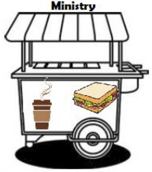
See summer schedule for dates